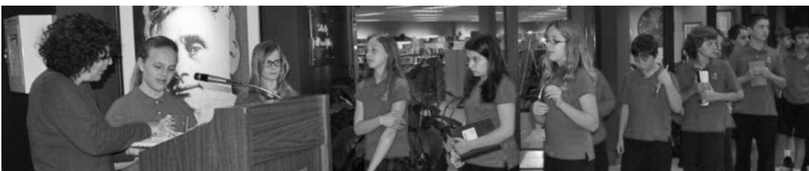
Reading of the names by students from Covenant Christian School at the Holocaust Museum on Yom HaShoah