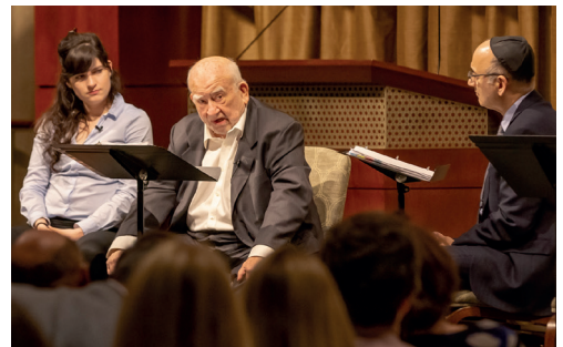
Ed Asner flanked by actors Liba Vaynberg and Ned Eisenberg

The reading was a very powerful kick-off to Holocaust education week that was co-sponsored by Temple Israel and HMLC. The week included a showing of the documentary Big Sonia , starring Holocaust survivor Sonia Warshawski of Kansas City, at Temple Israel, HMLC's Yom HaShoah Commemoration at Shaare Emeth, and a private event for HMLC and TI's major donors.